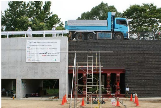
Fig.4 The embankment is formed on the facility

August and September 2020, NILIM conducted a joint experiment with Gifu University. In this experiment, a new pavement reinforcement technique developed by Gifu University was evaluated. (Fig.4 Fig.5)