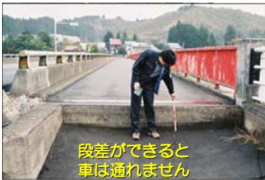
Fig.1 A step in approach section of the bridge

These steps disrupt the road network and interrupt the passage of emergency vehicles.