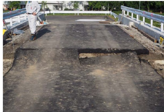
Fig.5 The step after experiment (There are reinforcing materials on the left side.)

The following is a link to the video about the experiment (only Japanese).