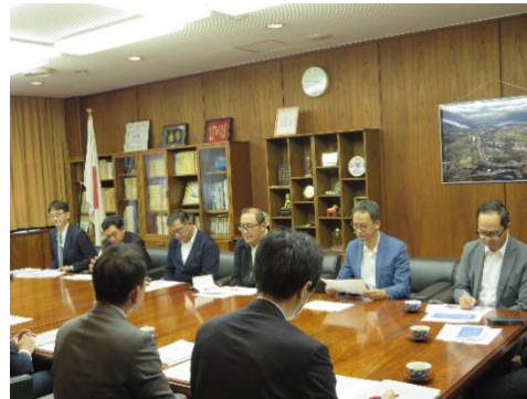
Exchange of opinions

They visited three kinds of facilities, "Test Track", "Full-scale tunnel experiment facility", and "30MN large-scale universal testing machine".